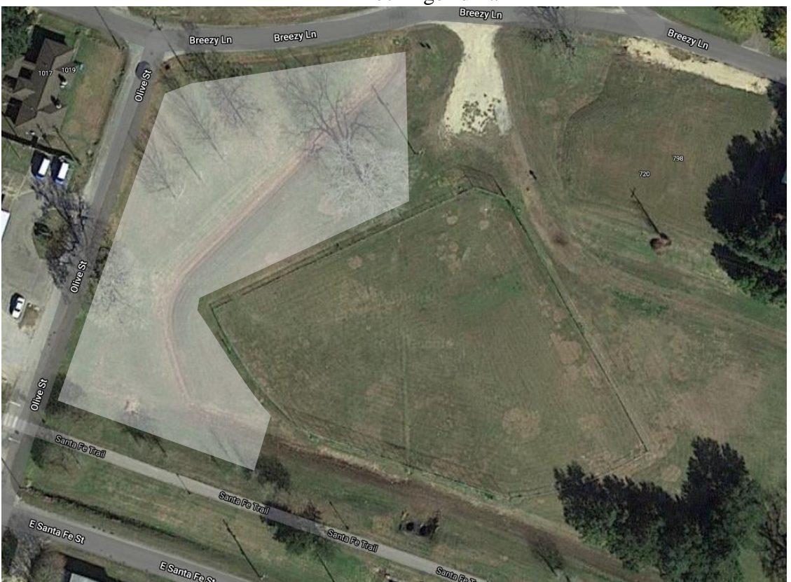
Need: Waterline, lighting, additional parking spaces, fencing (boundary, separating small from large side & double-gate entrance), mulching, benches, trash cans, dog bag posts, water fountain for pet/human, signs for rules, play features for dogs (both small and large)